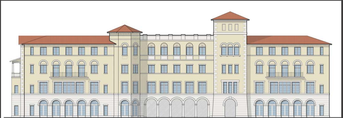
South Elevation, The Riverwalk at Central Park Medical Office Building.

The Riverwalk at Central Park Medical Office Building schematic designs are now complete. Located within the master plan for The River Walk at Central Park, the building is a 4-story medical office building — with a total building gross area of approximately 110,000 sf. Primary use of the building will be private physician offices with the possibility of medical clinic uses and first floor retail tenants. The building will physically connect to the planned hospital at the first, second and third floor. Parking will be in an adjacent parking vault.