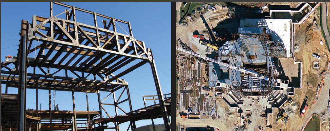
Construction continues to progress at the Carmel Regional Performing Arts Center, Carmel, IN.