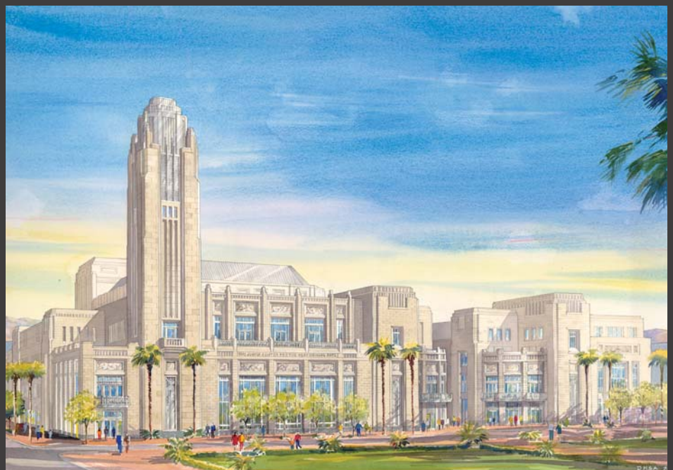
Most recent rendering of the Smith Center for the Performing Arts, Las Vegas, NV.

Indiana limestone has been selected for the exterior façade of the Large Hall at the Smith Center for the Performing Arts in Las Vegas, Nevada. Swedish Mahogany granite base will be used to compliment this choice, and other portions of the façade work will be done in a matching stucco. David M. Schwarz Architects is in the process of selecting interior stone, fabric, wood veneers, paint colors, etc for the project. Groundbreaking is scheduled for early 2009.