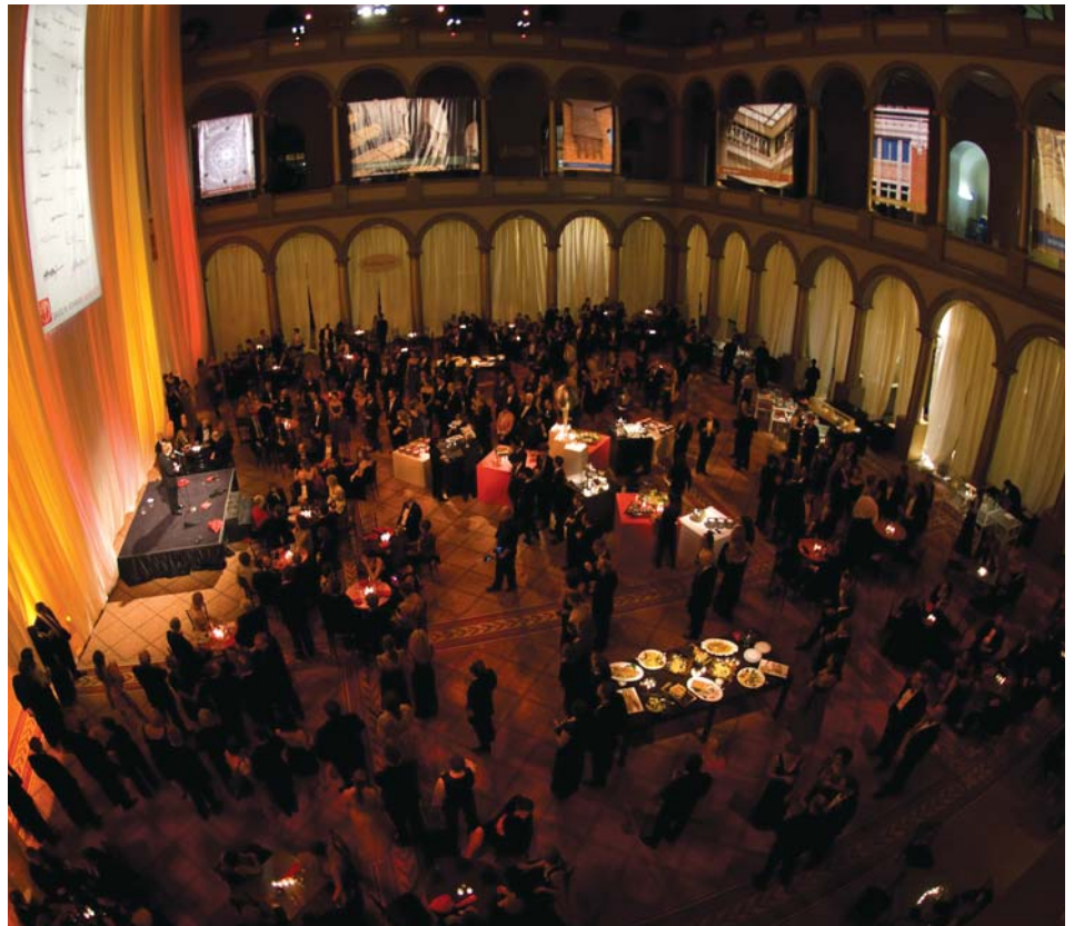
David M. Schwarz Architects Anniversary Gala at the National Building Museum.