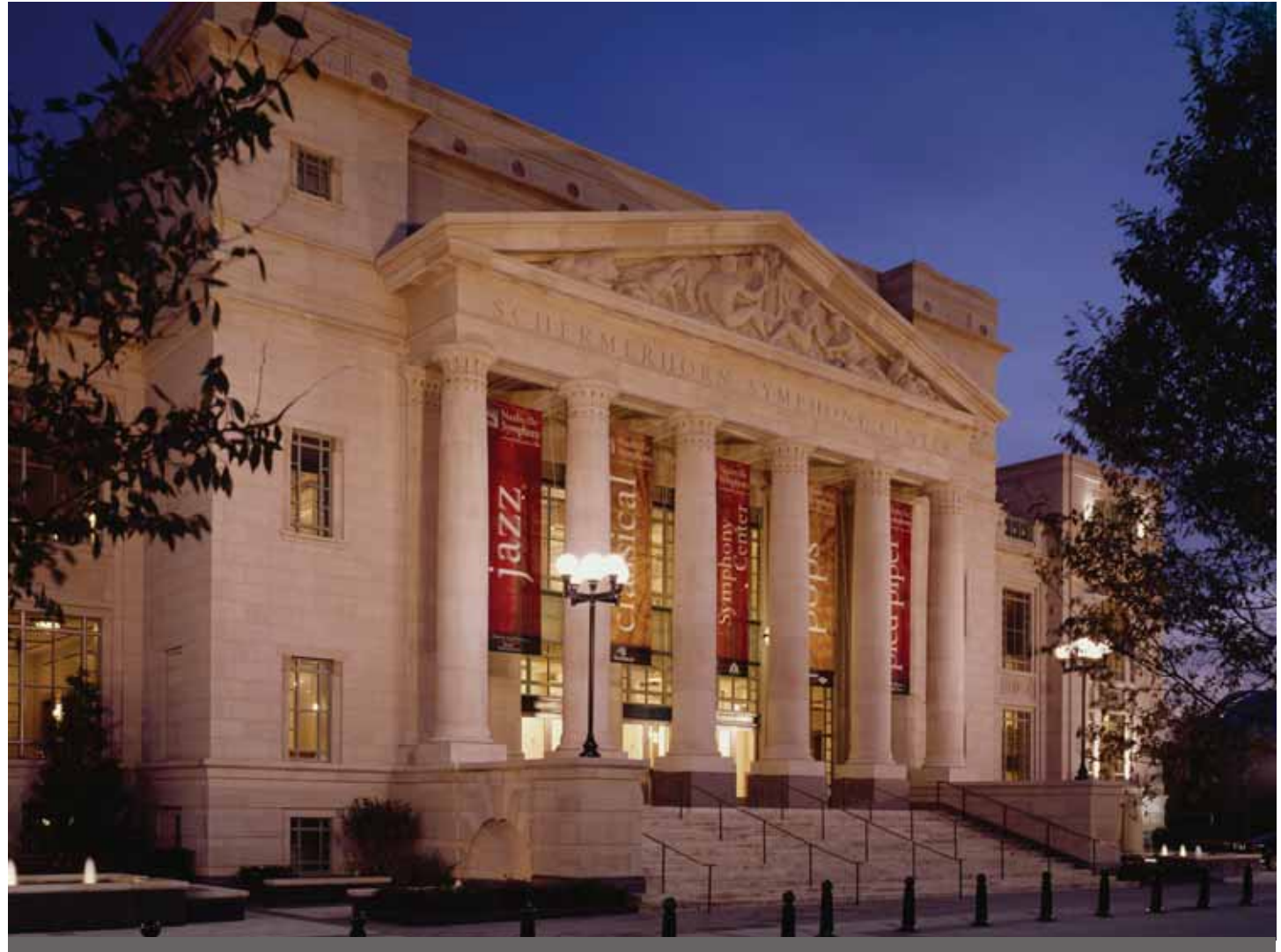
Schermerhorn Symphony Center in Nashville, TN.