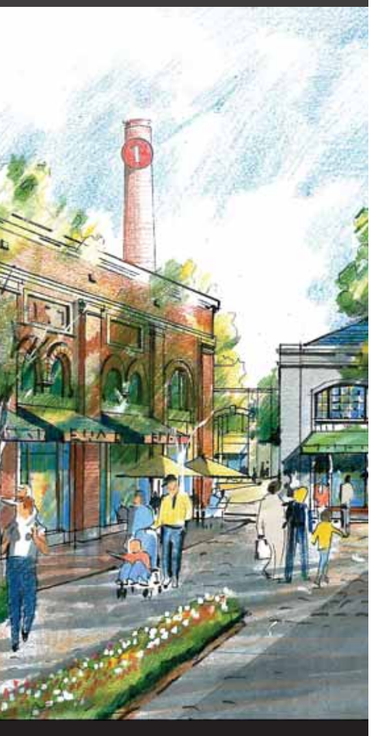
DMSAS rendering for the Villages at Urbana.

DMSAS has been commissioned to create a concept plan for a new, 600,000 SF retail development for Prime Retail. The project will be part of the Villages at Urbana, a mixed-use master planned community being developed by Natelli Communities and located near Fredrick, Maryland. The plan is organized around a pair of primary public squares linked by a network of streets and outdoor pedestrian ways. Construction is anticipated to start mid-2009.