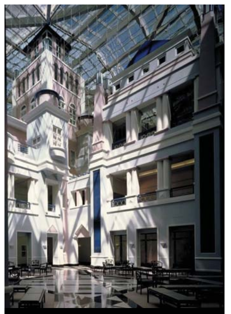
The atrium at Cook Children's Medical Center, Fort Worth, TX.

In the interior, the main hospital services, patient rooms and corridors are all situated around a seven-story high atrium that floods the facility with sunlight and provides an easy way for patients and families to orient themselves. "The atrium functions as a town square. There's always something going on there, something cheerful like a book fair or a visit from Santa Claus," notes Tom Greene, DMSAS