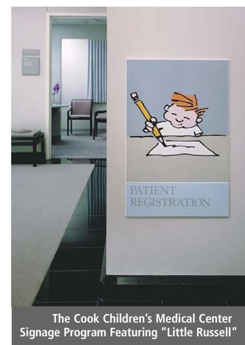
principal and project manager for Cook.

Rooms for bone marrow transplant patients overlook the atrium on the third floor. Due to the suppressed immune systems of these patients, there is a need to isolate them even from their own families. The separation can be grueling on the child and the entire family. Cook's design includes private balconies that allow the family to visit with their child and allow the child to feel connected with the interactivity of the community without compromising privacy.