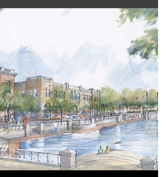
The River Walk at Central Park, Flower Mound, TX.

The River Walk at Central Park, the new central business district in Flower Mound Texas. moves closer to reality. The owner and team of consultants continue to work with town of Flower Mound staff on developing all of the necessary amendments to the town's master plan, Land Development Regulations, and Zoning Ordinance. Most recently, the town's initial traffic impact analysis was completed. The hospital's architect is now in schematic design with foundation work scheduled to commence mid-fall of this year. DMSAS anticipates starting design work on the first medical office building by late spring.