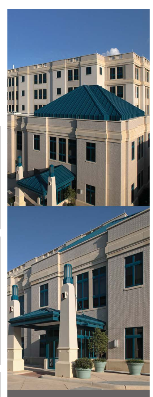
Careful massing design of Cook's North Patient Pavilion (added in 2003) Creates a small building pedestrian experience while fulfilling a big building hospital program.

Parking facilities were designed that would allow for additional stories to be added to the main structure as needed to support facility growth.