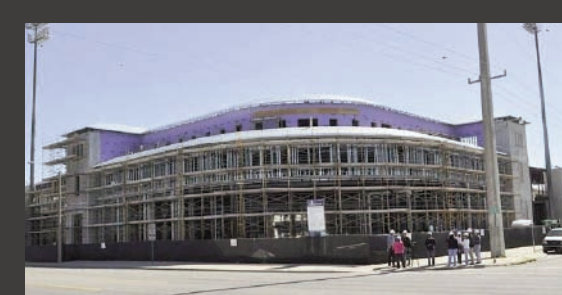
The Ed Smith Stadium main entrance at home plate.