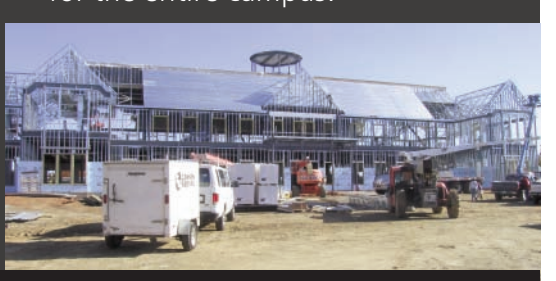
View of the Spartanburg Day School

Construction continues on the Spartanburg Day School with the recent completion of the structural framework of the building. The new facility is on track for completion next summer for the start of school in 2011. In addition, DMSAS is designing an open-air colonnade to connect the existing school structures to the new building, creating a more unified aesthetic for the entire campus.