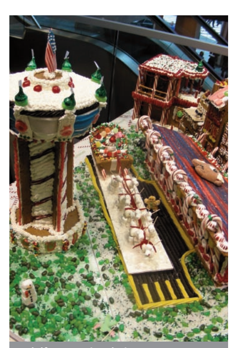
Rudolf International Airport Airheads Control Towe

The sweet smell of icing and gingerbread permeated the air as architects and designers labored over their candy laden masterpieces at the fifth annual Gingertown event. For the past 4 years, DMSAS has brought together local DC architects, designers and building industry colleagues to create a sugary town from gingerbread and candy for fundraising and donation to local charities. This year, DMSAS decided to expand the tradition and called on colleagues in Dallas and Nashville to build their own sweet streets, making Gingertown a national event.