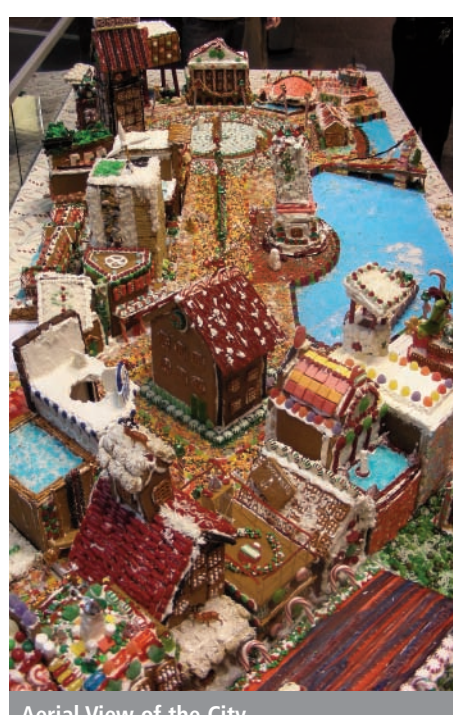
Aerial View of the City