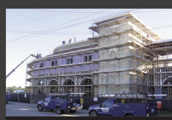
The Orioles' Ed Smith Stadium in Sarasota, Florida.

The Orioles' Ed Smith Stadium spring training facility in Sarasota Florida is heading toward completion for occupancy on March 1st, 2011. The 85,000 square feet of new construction will wrap the existing structure providing new fan amenities and staff offices, luxury and party suites, as well as an extended roof structure that will provide more shading to the 1,500 seats being added to the bowl.